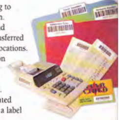
Barcode Anything isn't just for inventory! Use it to track time assets, manage paperwork, or control rental check-outs and memberships.

So at any given moment, you can see whether everything's accounted for.