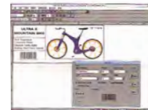
Add graphics, logos, and specific information to your labels with drag-and-drop ease.

Then apply the labels to your stock and you're in business. Simply pass the Barcode Anything scanning wand over the barcode and it's tracked instantly.