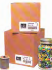
Use Barcode Anything to print custom barcode labels to track anything in your inventory – no matter how big or small.

Use Barcode Anything to track every sale or return. Merchandise received and shipped. Even items transferred between your business locations. It tracks every transaction and does the tallying for you, then sorts the data into easy-to-read reports. And every report is updated automatically every time a label is scanned.